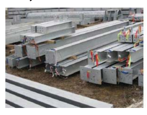
Figure 1- Laydown Yard Photos

One common issue we see across our 1,000+ audits of operating plants is that mid and long term maintenance issues are often sometimes created during initial plant construction. The issue is that construction is a very complex process with many, many opportunities for error. Anyone who has ever visited a laydown yard is certainly familiar with this issue.